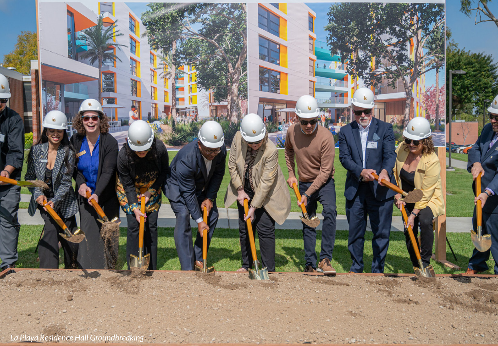
La Playa Residence Hall Groundbreaking

La Playa Residence Hall Opening Fall 2026