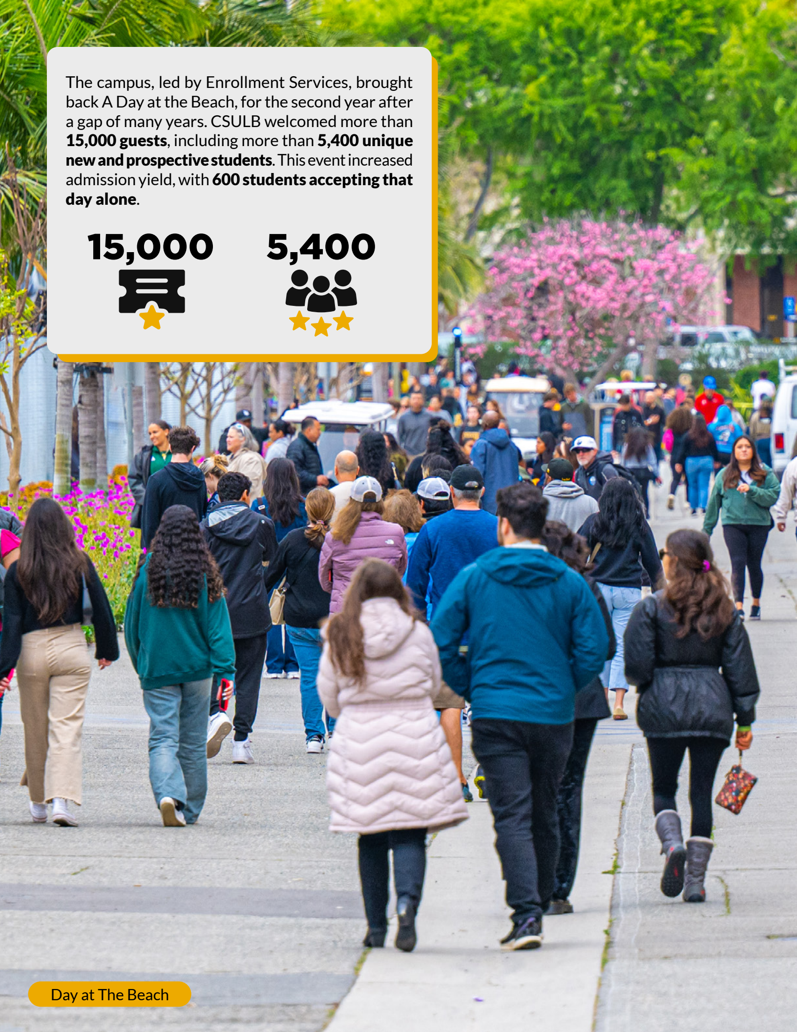
Day at The Beach