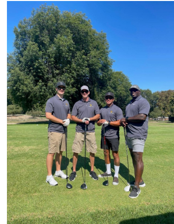
University Police joined a Millikan High School golf fundraiser as part of community outreach.