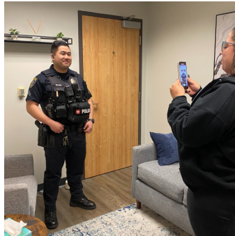
MADD California UPD partnered with MADD California to create educational content for college students.