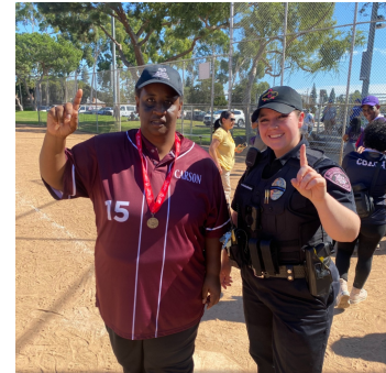
Special Olympics UPD had the honor of awarding medals to athletes in the Special Olympics Southern California.