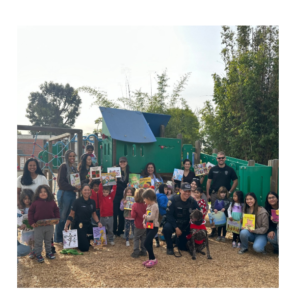
119 Books Donated to the Isabel Patterson Child Development Center

In October, UPD celebrated the grand opening of the new Community Engagement Office. Located next to Amazon @ the Beach, this space will serve as the main office for the Community Service Officers (CSOs) and will be open to the campus community who want to stop by to learn and ask questions about UPD's safety programs.