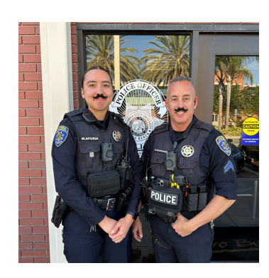
Movemeber UPD participated in NoShave November to raise funds and awareness for men's health.