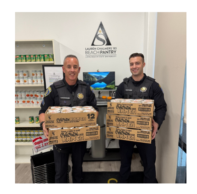
Beach Pantry Donation UPD officers donated cups of noodles to the Laurén Chalmers '83 Beach Pantry which supports students in need.