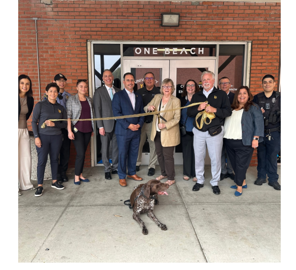
Grand Opening of the Community Engagement Office

In October, UPD celebrated the grand opening of the new Community Engagement Office. Located next to Amazon @ the Beach, this space will serve as the main office for the Community Service Officers (CSOs) and will be open to the campus community who want to stop by to learn and ask questions about UPD's safety programs.