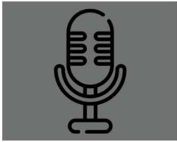
Beach XP Podcast