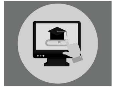
XP and Beyond Canvas Shell

A new and exciting addition to the program is the launch of the Beach XP Podcast . Recognizing the unique needs of CSULB as a commuter campus and embracing new media and content consumption habits, the podcast offers students an accessible way to stay connected to campus life through engaging, relatable content. Complementing this innovation is the creation of the Beach XP and Beyond Shell , an organizational Canvas shell that serves as a central repository of resources. Students remain enrolled in this resource hub even after completing their first year, ensuring continued access to tools, support, and opportunities throughout their college journey. Additionally, the program is introducing new gamified activity modules , designed to make learning both interactive and enjoyable. These modules not only enhance engagement but also encourage students to actively explore campus resources and develop essential skills. Together, these initiatives broaden access and adaptability, making CSULB a true hub of inclusive, accessible, and flexible learning.