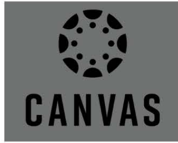
One-Stop Shop Canvas Shells