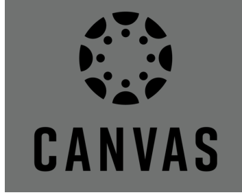
One-Stop Shop Canvas Shells