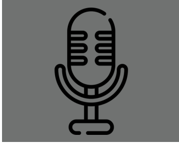
Beach XP Podcast