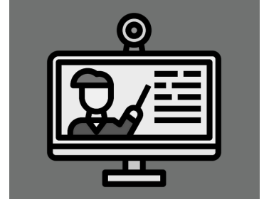
XP and Beyond Canvas Shell

A new and exciting addition to the program is the launch of the Beach XP Podcast . Recognizing the unique needs of CSULB as a commuter campus and embracing new media and content consumption habits, the podcast offers students an accessible way to stay connected to campus life through engaging, relatable content. Complementing this innovation is the creation of the Beach XP and Beyond Shell , an organizational Canvas shell that serves as a central repository of resources. Students remain enrolled in this resource hub even after completing their first year, ensuring continued access to tools, support, and opportunities throughout their college journey. Additionally, the program is introducing new gamified activity modules , designed to make learning both interactive and enjoyable. These modules not only enhance engagement but also encourage students to actively explore campus resources and develop essential skills. Together, these initiatives broaden access and adaptability, making CSULB a true hub of inclusive, accessible, and flexible learning.