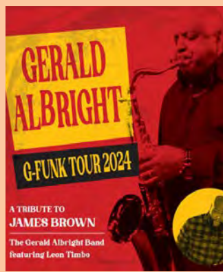
Gerald Albright's Tribute to James Brown

East Shoreline Drive • Long Beach, California