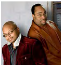
Pieces of a Dream