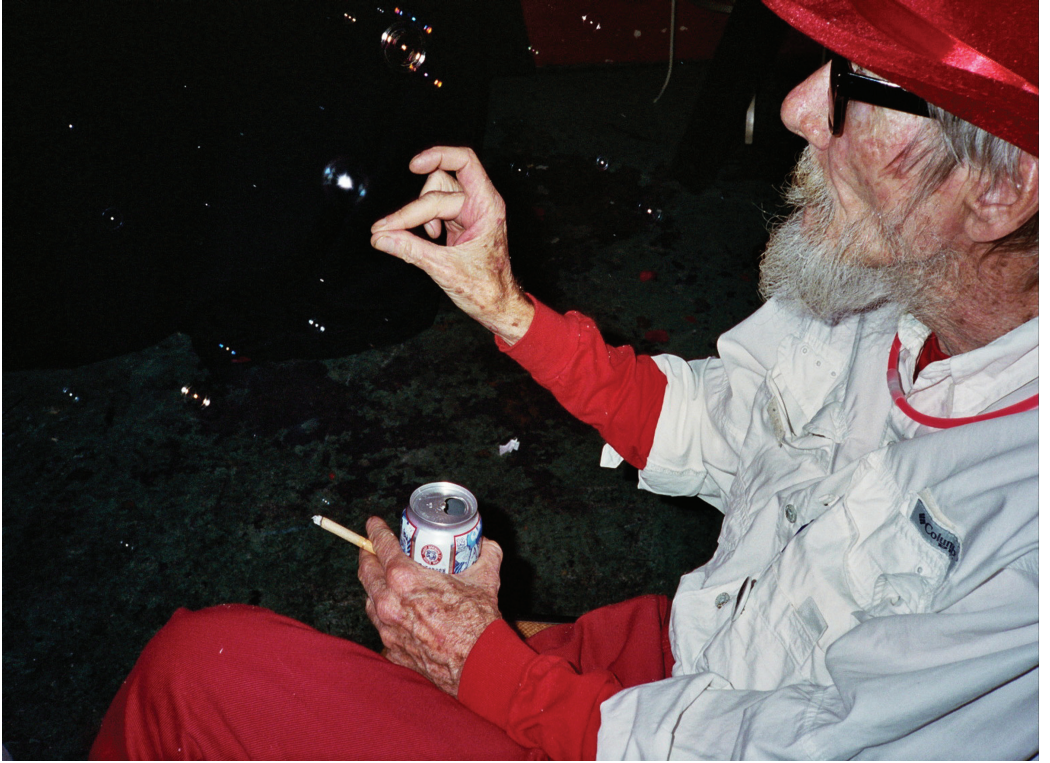
RED MAN AND BUBBLES By NIKKI O