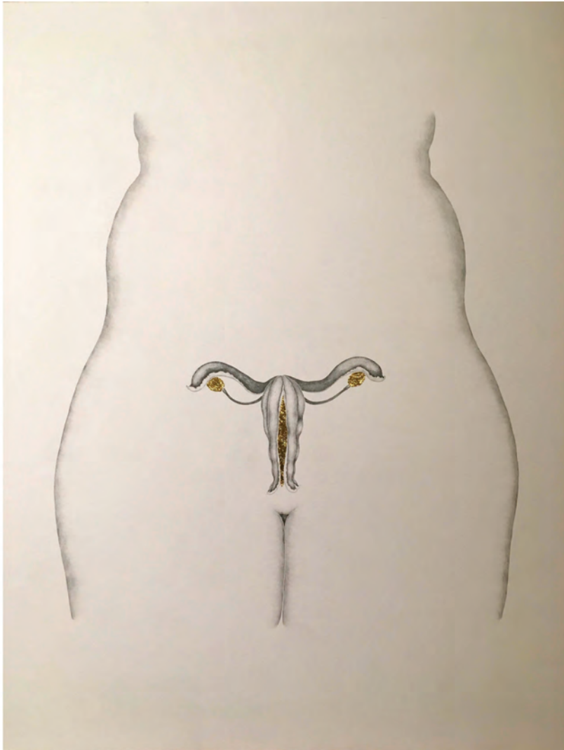
Flower Gold Uterus, Lydia Kegler