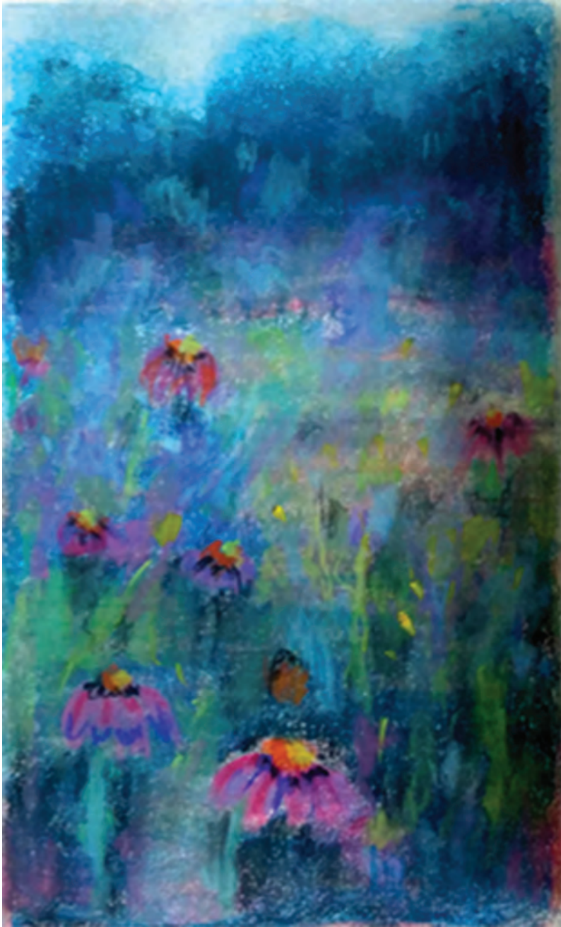
Untitled, Aleksandra Dimitrijević