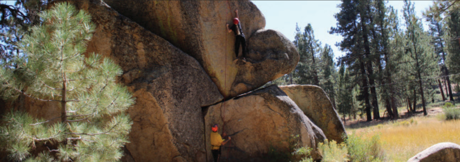
The Retreats Determination Rock Climb