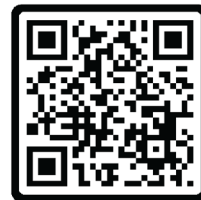
Calculating your GPA

It is essential for transfer students to have a minimum GPA of 2.0. GPAs are determined by dividing the total number of units attempted into the total number of grade points awarded. CSULB does not include +/- points if another school shows them on their transcripts.