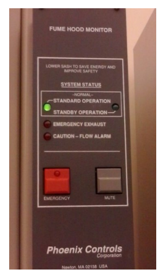
Figure 3. MLSC hood Phoenix Controls unit indicating proper operation. Note green light lit.