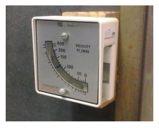
Figure 2. MICRO hood Vaneometer. Note airflow reading above 100 LFM (arrow).