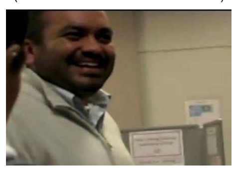
Introduction to Gerontology (video) (Click the link to view the video)

GERN 400I addresses the study of middle age and aging. Using an interdisciplinary approach, bio-physiological, psychological, and sociological aspects of aging are discussed. More specifically, through classroom lectures and activities and the completion of service learning in the community, we will explore, analyze, and evaluate the impact of aging on gains and losses in physical and mental health, interpersonal well-being, social roles, personality, and stress; larger social, cultural, and economic issues including retirement, housing, and public policy are also analyzed.