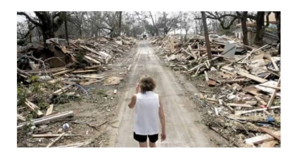
CSULB Alternative Spring Break -- New Orleans 2012 (Click the link to view the video)

The course will examine one of the most important events of our lives: Hurricane Katrina and its impact upon the Gulf Coast and the rest of the nation, with a particular emphasis upon the city of New Orleans. Members of this learning community will acquire a complex understanding of Hurricane Katrina not just as a severe meteorological event but as an event with very real implications for what is arguably the most unique city in America.