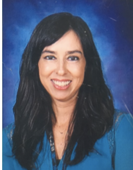
Providing a Space and Place to Learn