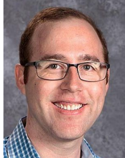
The Importance of Teacher Candidates in the Classroom