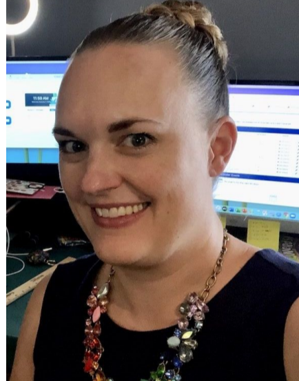
An Invaluable Partnership