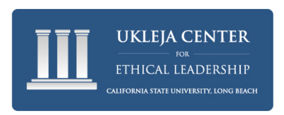
Ukleja Center's Student Leadership Institute

Twenty students participated in the Ukleja Center's two-semester Student Leadership Institute to explore ethical leadership issues related to business, government, education, healthcare, and other professional fields. This course enables students to discover their core values and build a strong ethical foundation upon which future decisions can be made. Teamwork, community service, and networking with guest speakers are integral to the program. Through off-campus classes hosted by the local business community, the course featured guest speakers from companies such as Boeing, HCVT, JetBlue Airways, and Target.