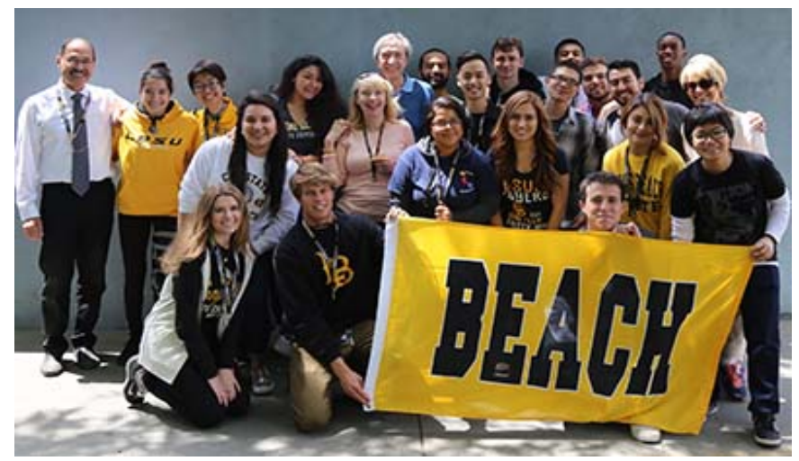
Student Leadership Institute Class of 2016 at Advocacy for Respect & Choice

Twenty students participated in the Ukleja Center's two-semester Student Leadership Institute to explore ethical leadership issues related to business, government, education, healthcare, and other professional fields. This course enables students to discover their core values and build a strong ethical foundation upon which future decisions can be made. Teamwork, community service, and networking with guest speakers are integral to the program. Through off-campus classes hosted by the local business community, the course featured guest speakers from companies such as Boeing, HCVT, JetBlue Airways, and Target.