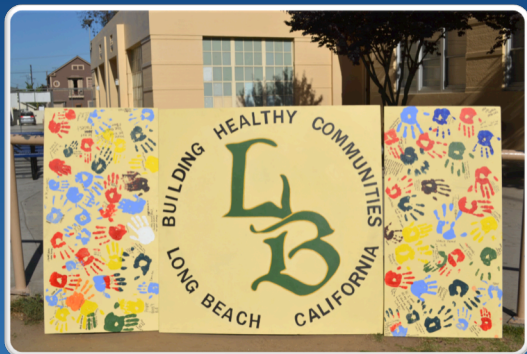
The BHC Long Beach AmeriCorps community mural project from MLK Jr. Day of Service 2012.

"This is a great bonding moment for me, the students and their friends... it provides a great opportunity for me to get to know the mentees better. They tell me things about their families, and about their homes and social lives so I can better understand where they are coming from".