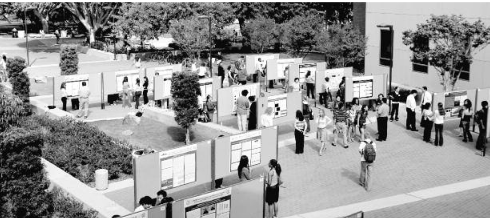
Annual student research poster session in the Nagel Courtyard.

The award is open to all junior and senior level chemistry or biochemistry majors with a minimum 3.0 GPA, who have completed at least one year of general chemistry, as well as organic chemistry, and who have a demonstrated need for financial assistance.