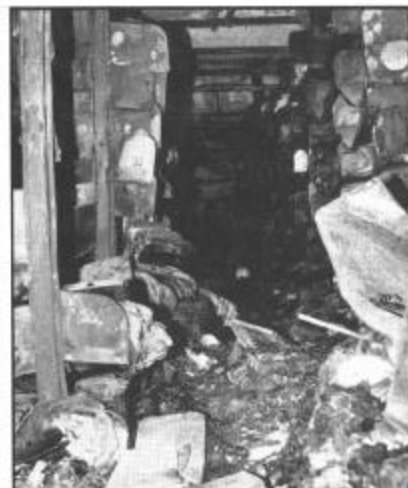
Periodicals shelves following the April 29, 1986, Los Angeles Public Library fire.

L os Angeles Public Library's Central Library, victim of two arson fires, benefitted from gifts of 114 volumes of journals by our department ( Analytical Chemistry, Biochemistry, Chemical Reviews, Industrial and Engineering Chemistry, Inorganic Chemistry, Journal of the American Chemical Society ). Most volumes were bound collections of several issues each. The Public Library's Science, Technology, and Patents Department was severely damaged by the April 29, 1986, fire, resulting in the loss of approximately one-third of its collection to fire and water destruction. Losses for the Library as a whole have been estimated at about twenty million dollars.