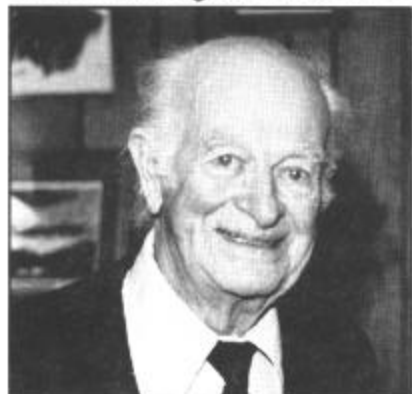
Dr. Linus Pauling, Nobel Laureate.