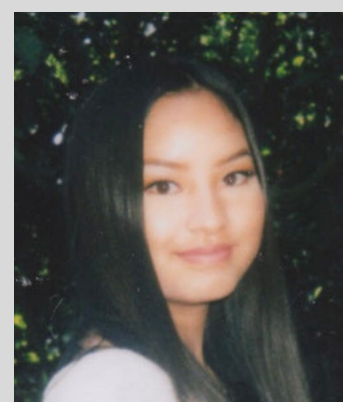
ASHLEY SET Community Health Education For the Child